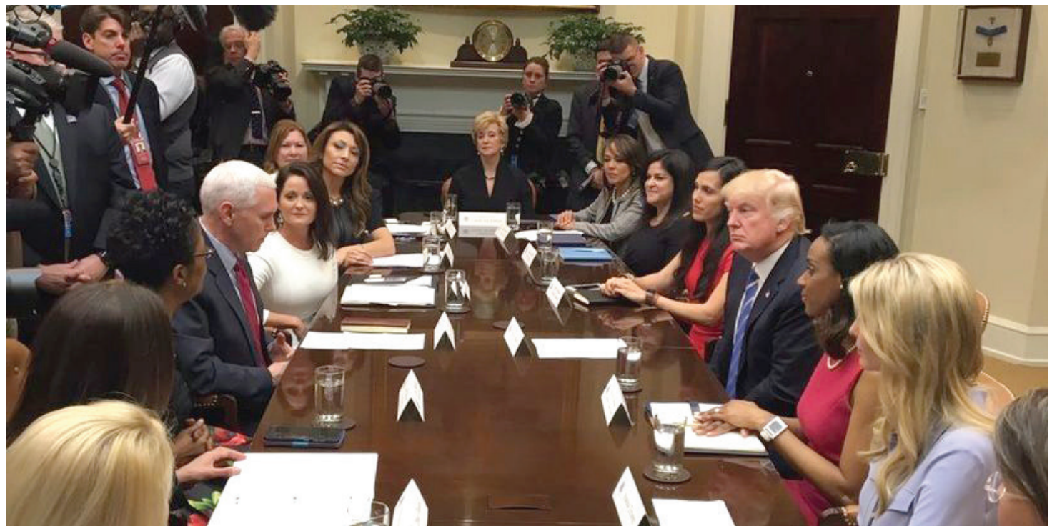
President Trump meets with women small business owners at the White House.